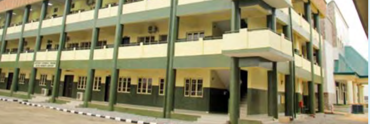
Maryland Comprehensive High School Lagos